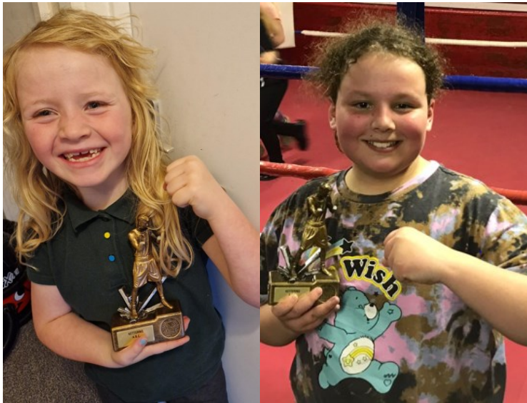
The sisters with their boxing trophies

Mawsley Community Primary School June 2023 Issue 5