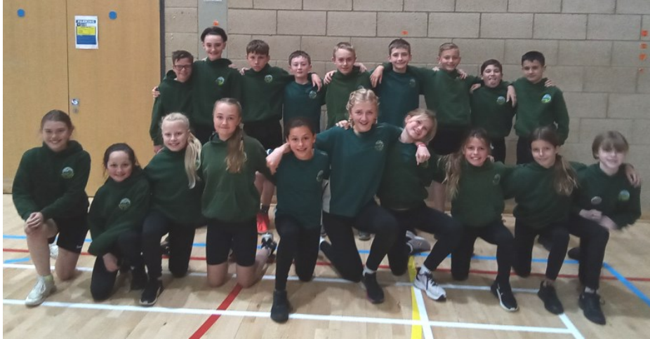
The athletics team

Our Year 5/6 Athletics team went to compete in the South of England Championships, which took place in Luton. They had previously won our district competition, then qualified from the county finals, which was the first time we had ever achieved this as a school. The children managed to come 10 th in the whole of the South of England - a brilliant achievement. The schools and children that we got to race against were exceptional, and it was a really great experience and challenge for our children to race, jump and throw against some of the country's best athletes. A massive thank you to all the parents/carers/family that travelled down to the competition in order to support the children, they really appreciated it!